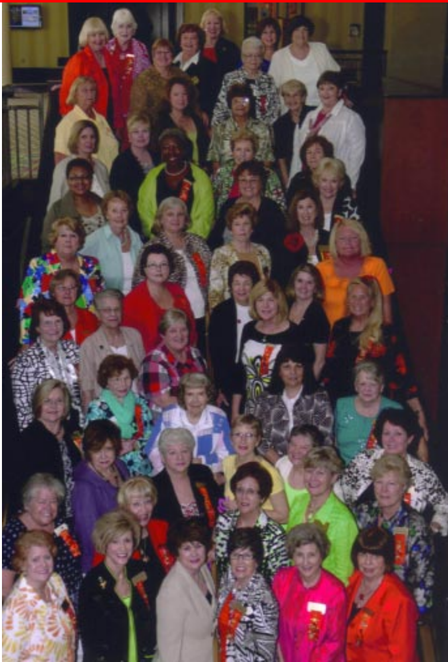
Florida Members at 2011 Southeast Regional Conference in Louisville, Kentucky

Vol. 57 No. 1 Mu State Organization of Key Women Educators Fall 2011